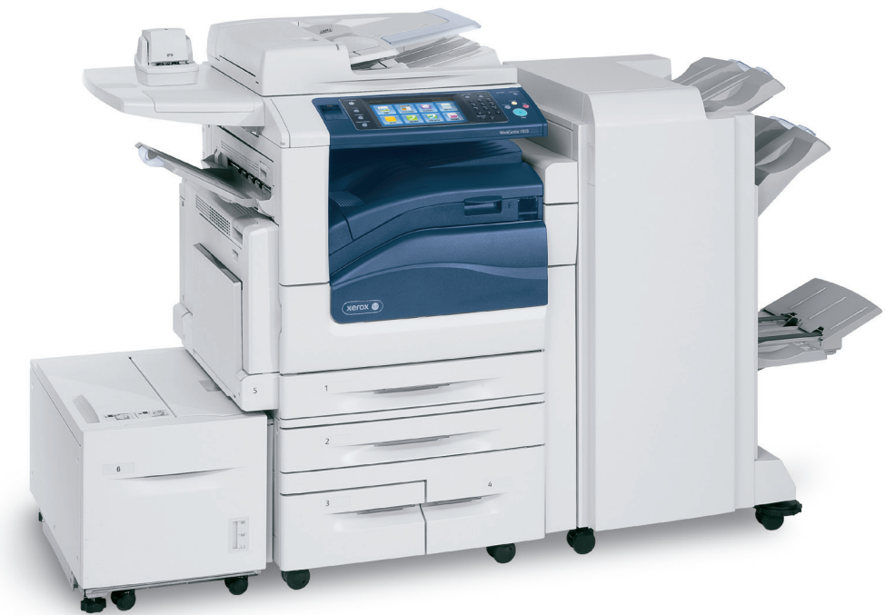
WorkCentre 7855 shown with optional Professional Finisher, Convenience Stapler and Work Surface and High Capacity Feeder.